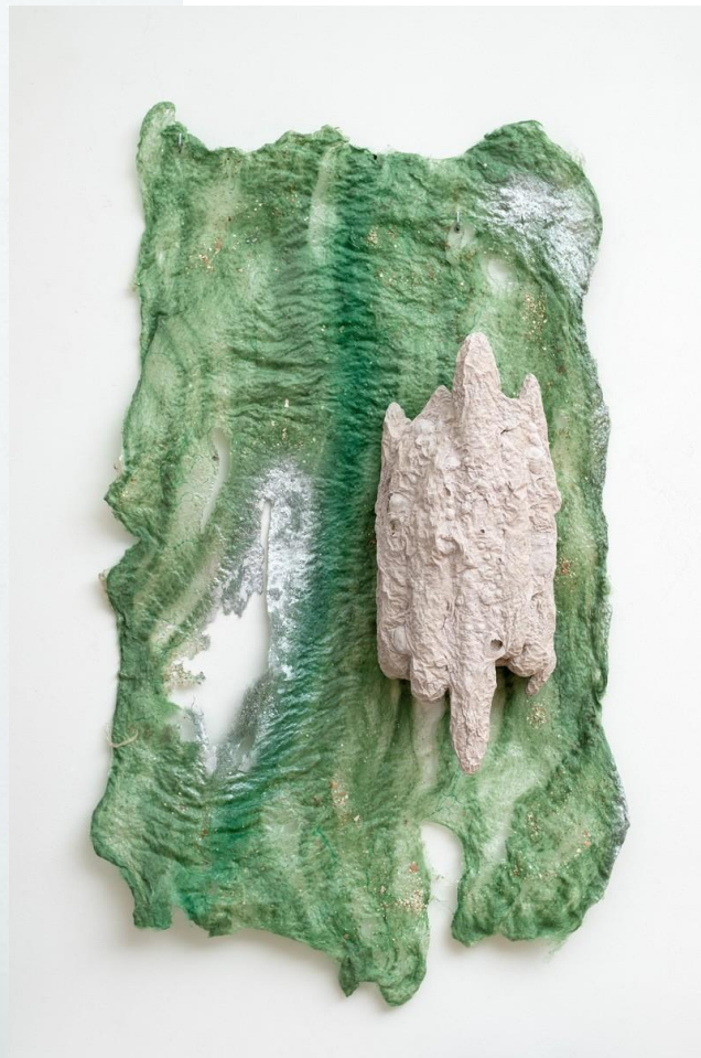
Laura Põld Boiling Skin, I

2023 High fired ceramics with lava glaze 37 × 16 × 12 cm 1200 EUR