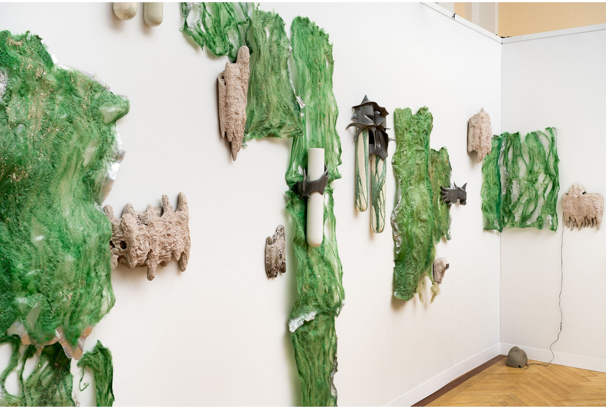
Laura Põld, Ways of Being. Kogo Gallery stand at viennacontemporary 2023.