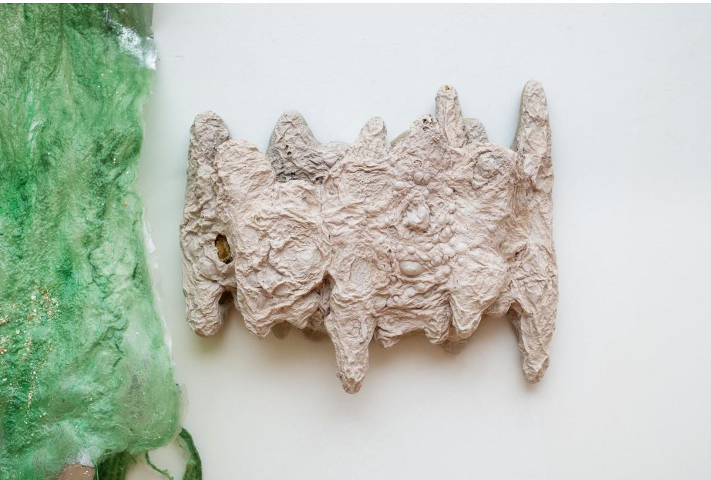
Laura Pöld Boiling Skin, III

2023 High fired ceramics with lava glaze 34 × 39 × 11 cm 1900 EUR