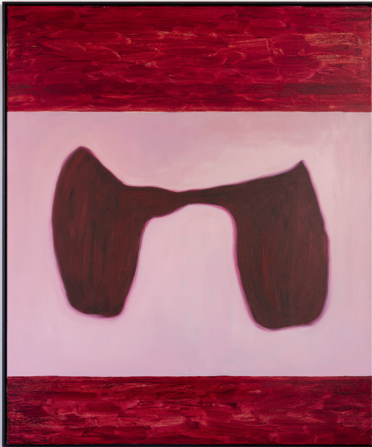
Untitled Veronika Hilger 2017 Oil on canvas in artistsframe 120x100cm 6600 €