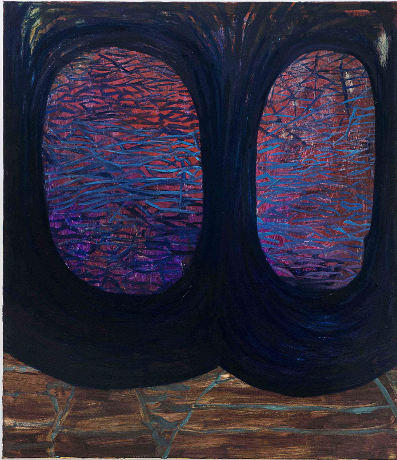
Untitled Veronika Hilger 2016 Oil on canvas in artistsframe 150x130cm 8400 €