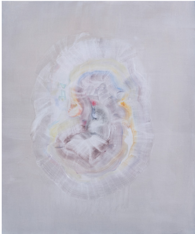
Changes 17 Paula Zarina-Zemane 2022 Oil on canvas, 60×50cm 2000 €