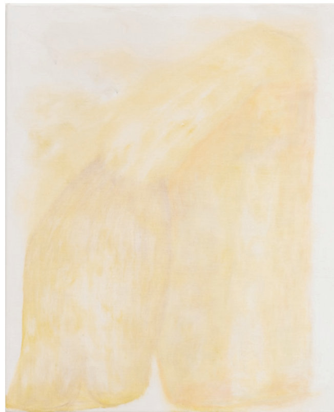
Tulip Milla Aska 2020 Oil on canvas, 50×41cm 1000 €