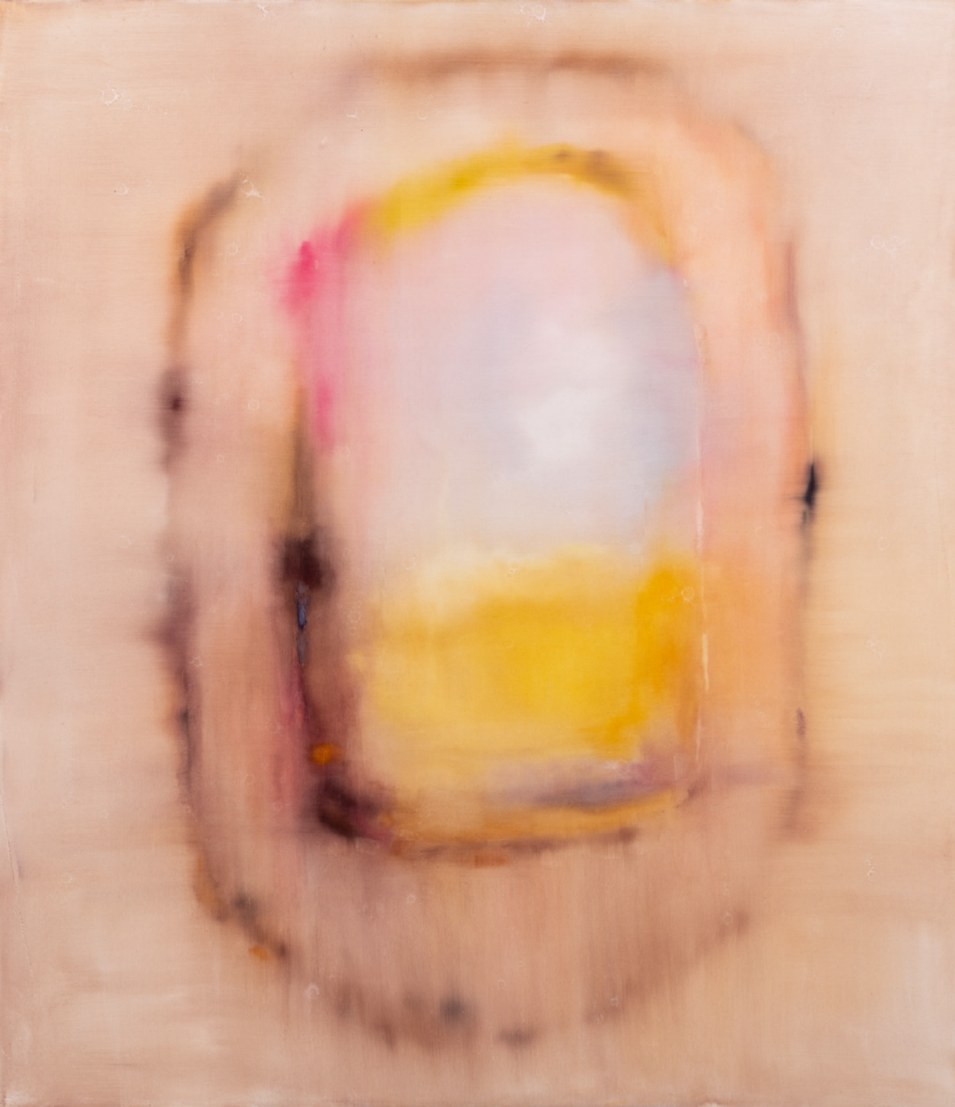
Changes 15 Paula Zarina-Zemane 2022 Oil on canvas, 150×130cm 3500 €