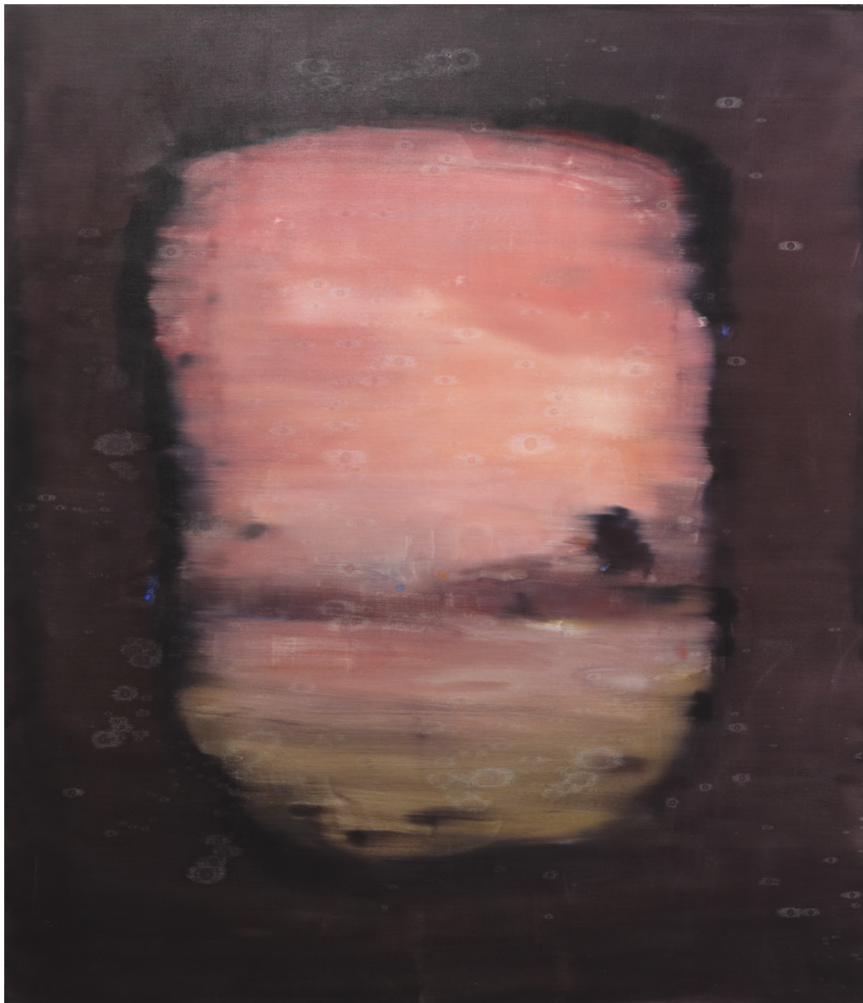
Changes 5 Paula Zarina-Zemane 2021 Oil on canvas, 150x130cm 3500 €