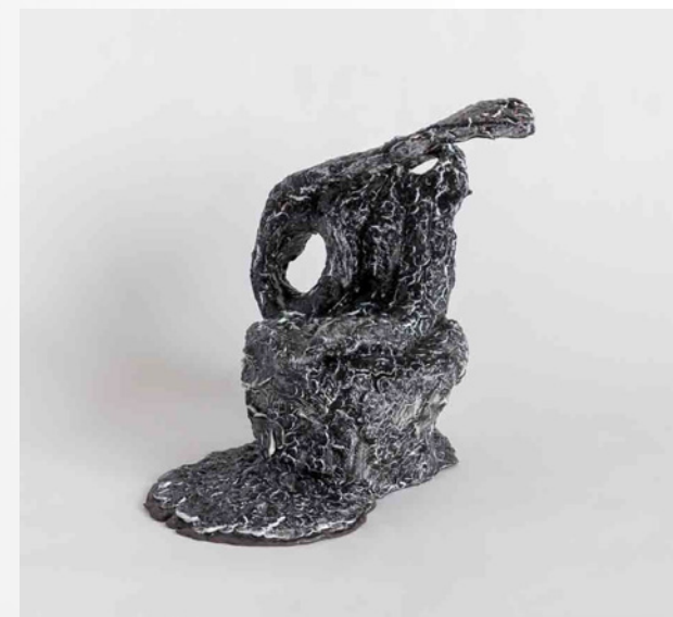
Untitled Veronika Hilger 2018 Glazed ceramic, 23.5×20×27cm 2900 €