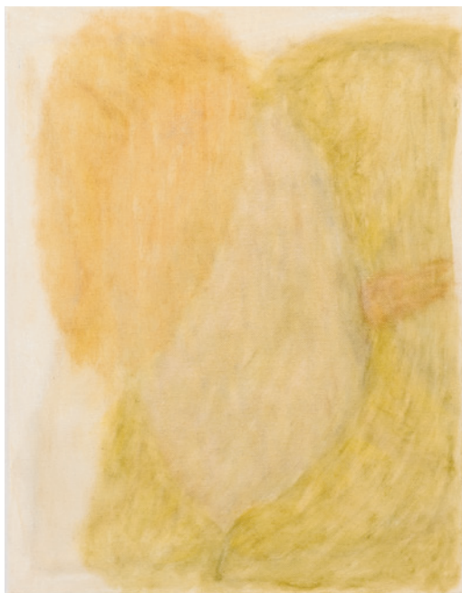
Heliosis Milla Aska 2022 Oil on canvas, 35×27cm 900 €