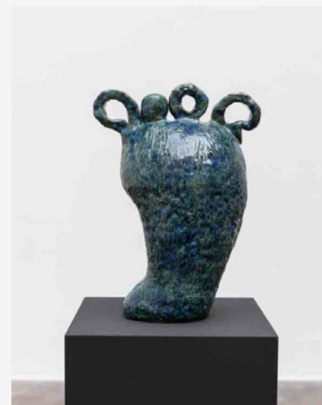
Untitled Veronika Hilger 2020 Glazed ceramic, 31×22.5×11 cm 2900 €