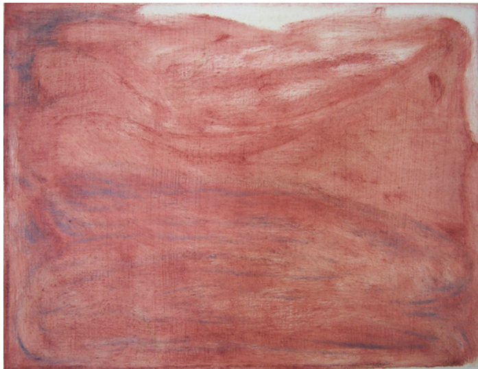
Windy Milla Aska 2021 Oil on canvas, 27×35cm 900 €