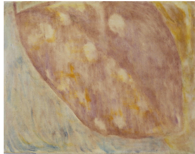
Fall Milla Aska 2020 Oil on canvas, 27×35cm 900 €