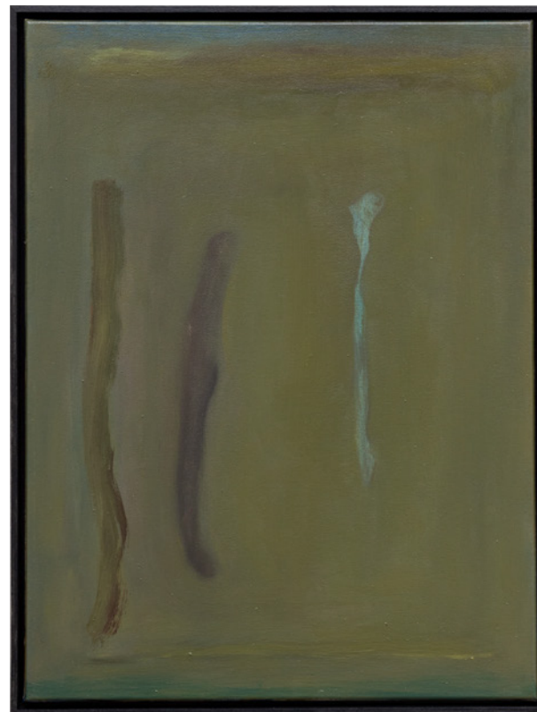
Untitled Veronika Hilger 2020 Oil on canvas in artistsframe 60x45cm 3200 €