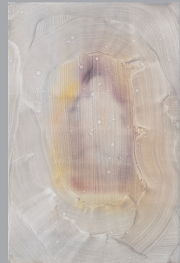
Changes 18 Paula Zarina-Zemane 2022 Oil on canvas, 20×30cm 900 €