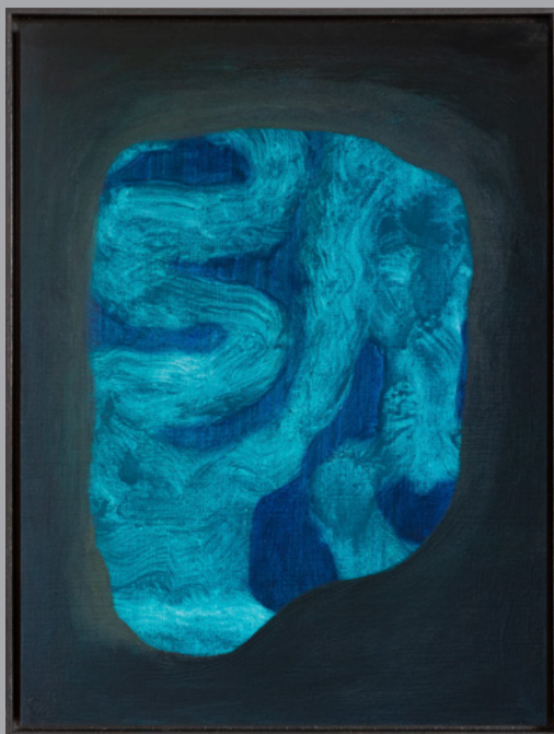
Untitled Veronika Hilger 2021 oil on paper on MDF in artistsframe, 39.8×29.8cm 2300 €