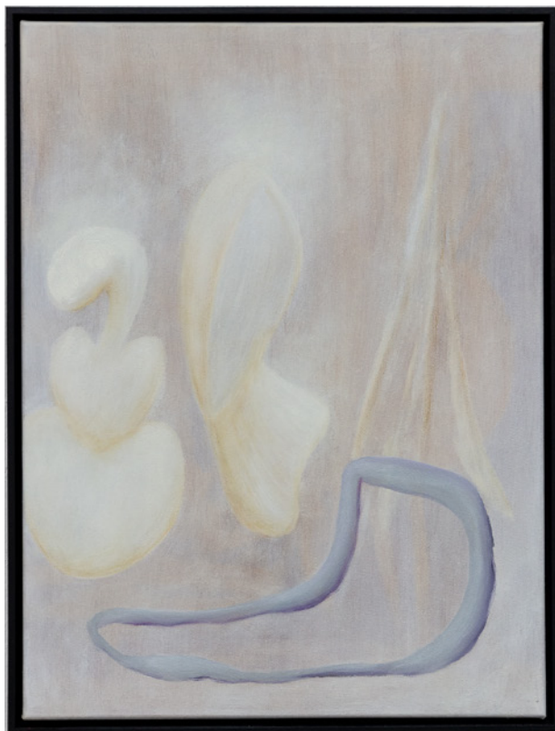
Untitled Veronika Hilger 2020 Oil on canvas in artistsframe 60x45cm 3200 €