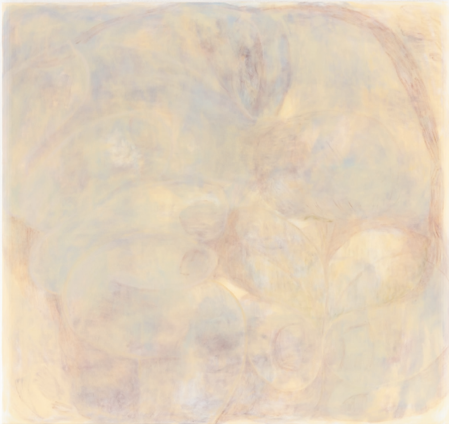
Meadow Milla Aska 2021 Oil on canvas 160×150cm 3500 €