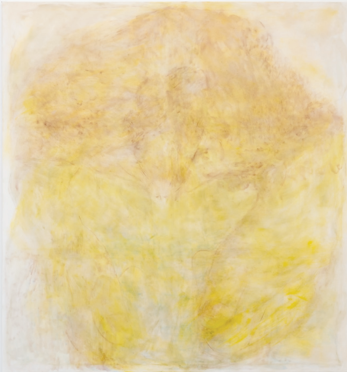
Spring Milla Aska 2022 Oil on canvas, 160×150cm 3500 €