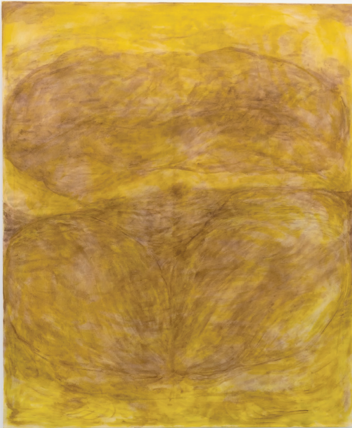
Dive Milla Aska 2022 Oil on canvas, 140×116cm 2800 €